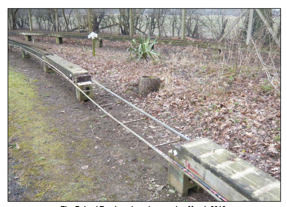
The Raised Track undergoing repairs, March 2018.